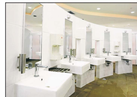
NIE's newly renovated toilets (above) now boast motion-sensor lighting, new mirrors and basin finishings.

Attend the YOG carnival at The Padang next Friday at 5pm, where the YOG countdown clock will be unveiled. Admission is free. For details, log on to www.singapore2010.sg