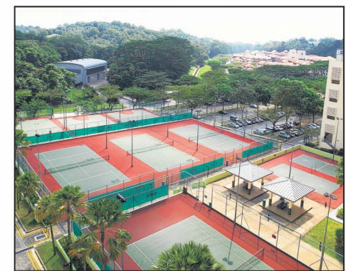
Existing facilities at NIE that will be refurbished include the tennis, basketball and handball courts (left). A completed upgrade is the bright new hockey pitch, fitted with improved lighting.

The Village Square (left) in NIE will function as the heart of the Youth Olympic Village. Highlights include the World Culture Village exhibition, featuring the histories and cultures of all 205 National Olympic Committees. There will also be a bank and retail shops as well as concerts in the area.