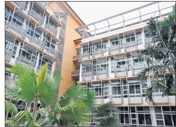
More than 5,000 YOG athletes and officials will stay at 10 NTU halls of residence (above). Located on the northern side of the campus, these buildings will get fresh coats of paint and have their rooms refurbished.

The Village Square (left) in NIE will function as the heart of the Youth Olympic Village. Highlights include the World Culture Village exhibition, featuring the histories and cultures of all 205 National Olympic Committees. There will also be a bank and retail shops as well as concerts in the area.